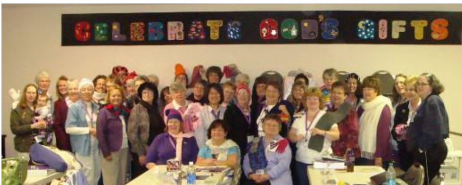
Ingathering of Hats, Gloves, Scarves at the Fall 2010 Board of Directors Meeting for the Nike Manor in Kent, WA.