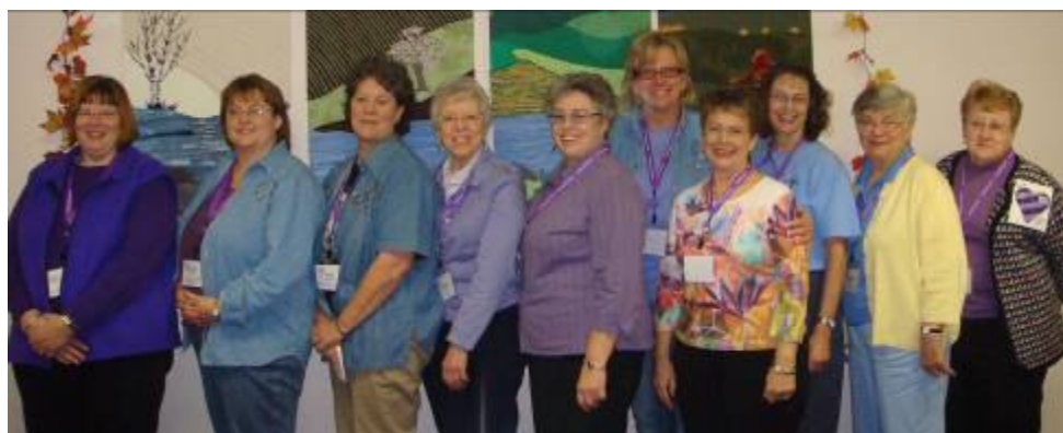
Zone Presidents at the Fall 2010 Board of Director's Meeting

Our Zone and Society Corner is devoid of articles! Be sure to send in updates on what you are doing locally! Pictures are great too! We'd all LOVE to see what you are doing!!!