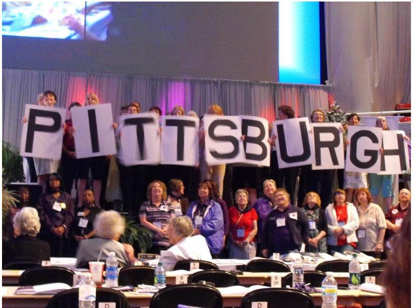
Invite to Pittsburgh, 2013