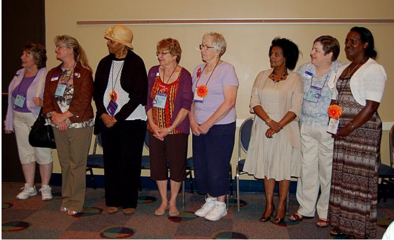
Heart to Heart Sisters, District Leaders, and District Presidents