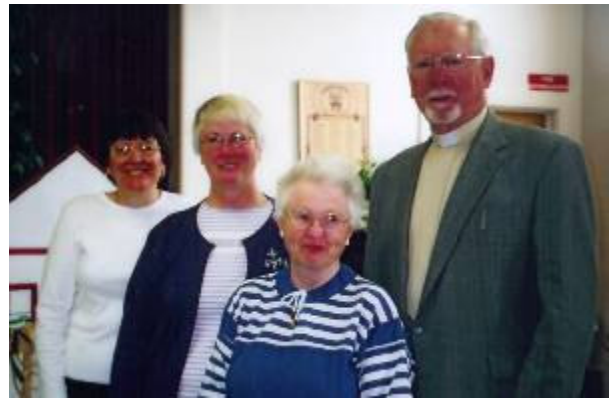
Trinity LWML, Olympia, September 8, 2007