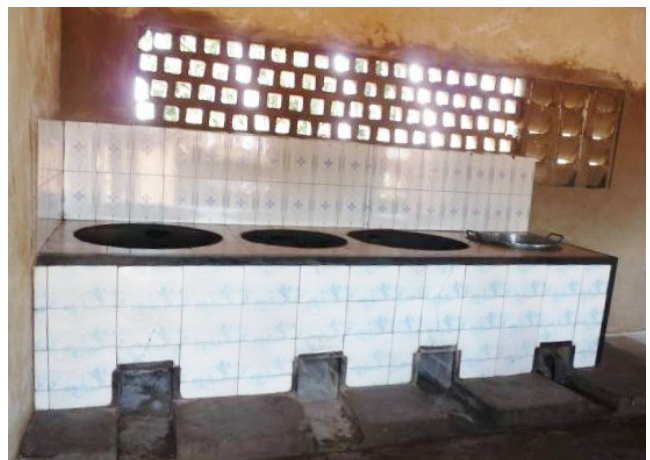
Top: Workers digging the foundation of the kitchen and boarding house; (Left) Original kitchen; (Above) New energy-efficient wood-burning stove.