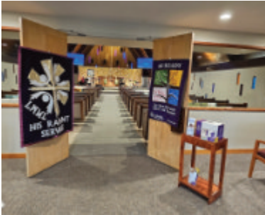
LWML Welcoming Entrance