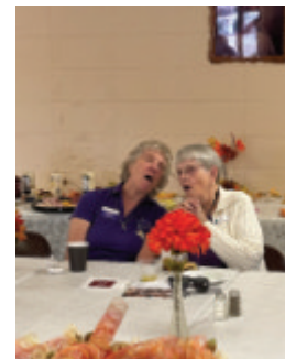
Singing in Harmony