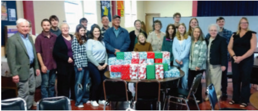
Christmas in September