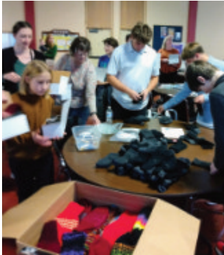
Putting together the Seafarer's Christmas boxes