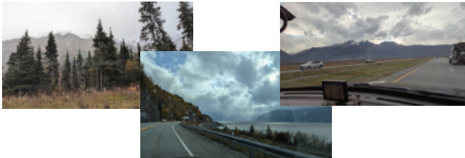
Views in Alaska

Evergreen Echoes is published quarterly by Lutheran Women's Missionary League Washington-Alaska District, an auxiliary organization of The Lutheran Church—Missouri Synod.