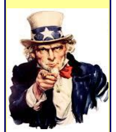
We want you to volunteer!

Please copy this issue for the women in your church! Print it in grayscale for copying on the copy machine or print out all the copies in color. If you would like to receive issues via email, contact the circulation manager. (This is the best way!)